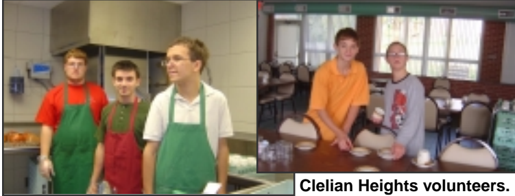
Clelian Heights volunteers.

Students from Clelian Heights, Greensburg, PA come each week to set the tables for the retreatants. Another group practiced the fine art of doing dishes using the commercial dishwasher. Under the caring tutelage of their teachers, these young people do their work with care and pride.