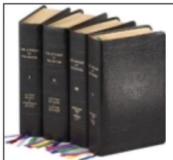
Leatherbound Liturgy of the Hours Large print • $ 189

Order Form: It's easy to order! Use the enclosed envelope to return your order to the Monastery or call (724) 834-7483 or Fax (724) 834-5772.