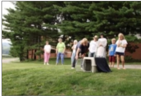
The cage door is opened and spectators watch for the young hawk.

Consisting of Sisters, volunteers, and cameras, our version of a press conference gathered to see our first red-tailed hawk that close.