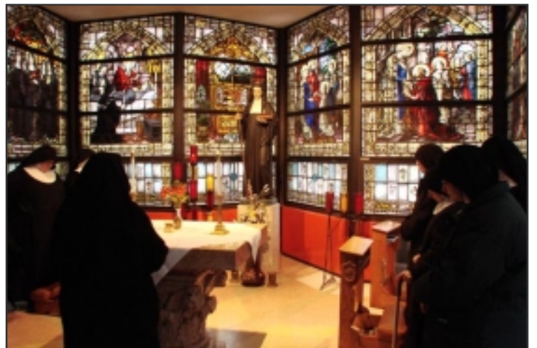
Inside the St. Walburga shrine at St. Emma Monastery.