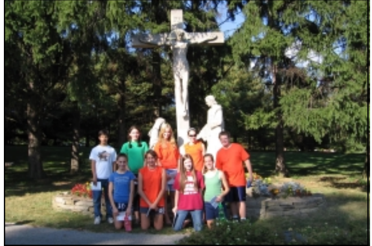
Members of the Mother of Sorrow Senior High youth group.

We enjoy meeting them and appreciate what they – and all of our other wonderful volunteers – do.