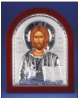
Christ Icon Sterling silver • $ 250