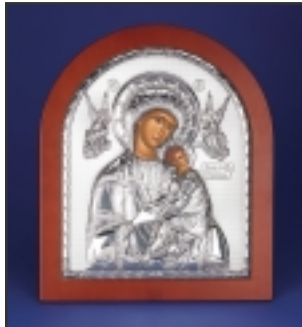
Our Lady of Perpetual Help Icon Sterling silver • $ 200