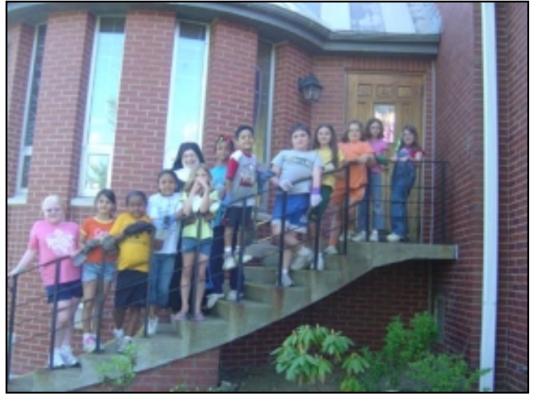
Jeannette Girl Scout Troop #21817 (Brownies), recently buried a time capsule in one of the flower beds which they planted — and plan to do so for the next five years.