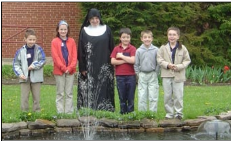
Five second graders of Holy Cross School, Youngwood, came for a day as part of their preparation for receiving their First Communion and Confirmation.